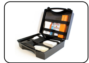
Optical Cleaning Kits