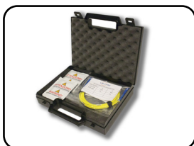
Test Reference Leads