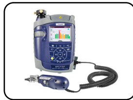
Viavi Test Equipment