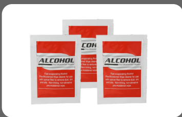
IPA PRE-SATURATED CLEANING WIPES (15 pcs) Dimensions: 65mm x 65mm

Our kits allow for thorough wet and/or dry cleaning for removal of stubborn grease marks and debris that will affect network performance. Enables cleaning of accessible fibre connector end-faces during the network build and on assemblies and receptacles for testing and maintenance purposes. Various tools will allow for good maintenance of your test equipment connectors and adapters as well. All items are available separately for replenishment.