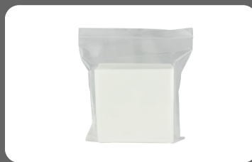
100 EXTRA DURABLE CLEANROOM WIPES (1 pk) Dimensions: 100mm x 100mm