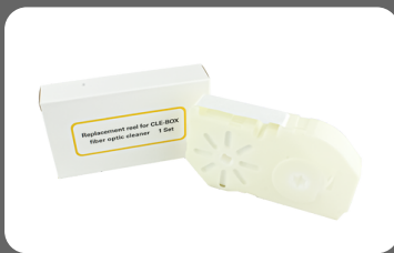
REPLACEMENT REEL (1 pcs) Dimensions: 50mm x 50mm