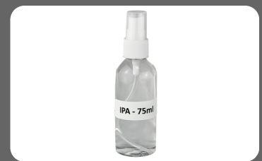
IPA FIBRE & CONNECTOR CLEANING FLUID (1 pcs) Volume: 75ml