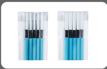
CLEANING STICK/SWAB (15 pcs) Dimensions: 1.25mm and 2.5mm