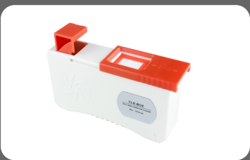
FIBRE OPTIC CONNECTOR FERRULE CLEANER (1 pcs) Use: 500 cleans